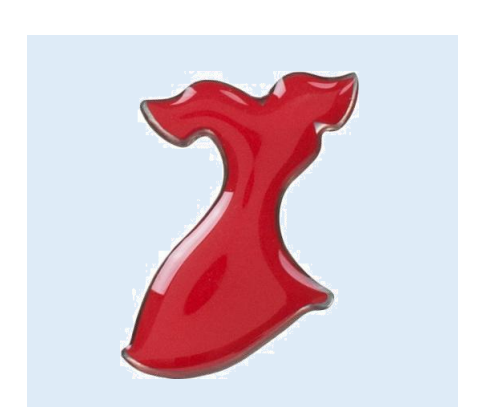
Red lapel pin $3