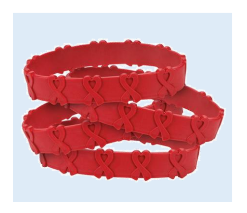
Red silicone bracelet $2