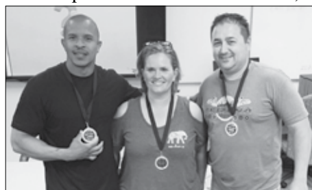
Jeopardy Game Winners for Leadership and Influence Training August 7-9

We currently have 50 grievances on the 2nd step agenda and none at the 3rd step. Thank you for your patience and understanding as we experience growing pains.