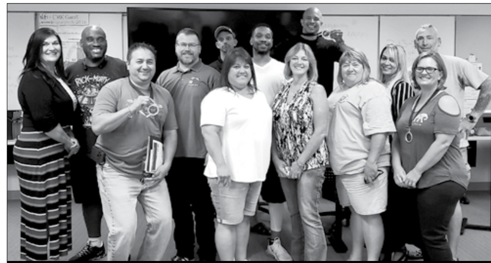
UAW-GM CHR Leadership and Influence Training class held August 7-9, 2019

Division II remains steady with transmissions, BEV3, and LT6 driving